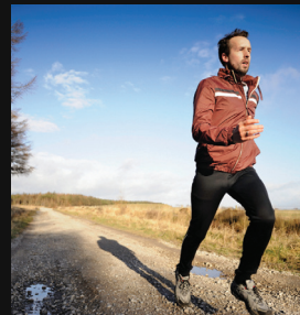
No need to carry keys

For more information about Yale Keyless digital lock and other Yale Digital products, speak to your local authorised Yale dealer, or visit our website: