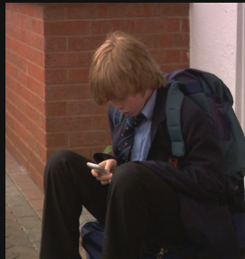
No more lost keys