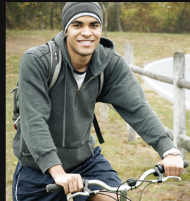
No need to carry keys